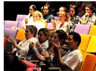
The Improbable Players perform scenes from their production of "Stages." while the audience gives their approval..